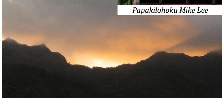
Pohakea Pass at sunset in Kunia O Līhu‘e